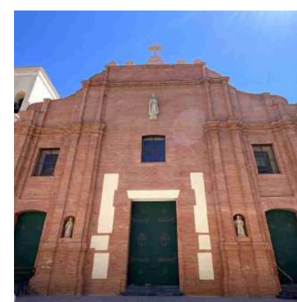
^ Santa Maria de Gracia Church