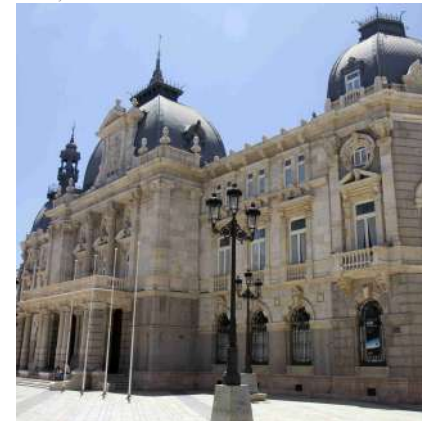
^ City Hall