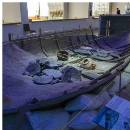
^ National Museum of Underwater Archaeology, ARQUA