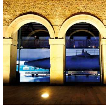
^ Naval Museum