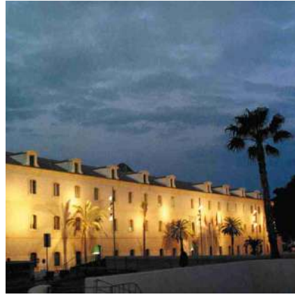
^ Campus Muralla del Mar