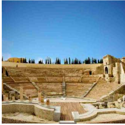
^ Roman Theatre