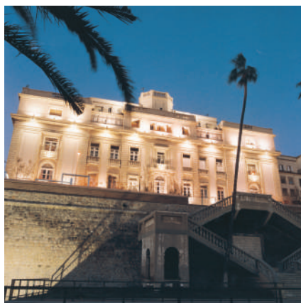
^ Midshipman's Barracks