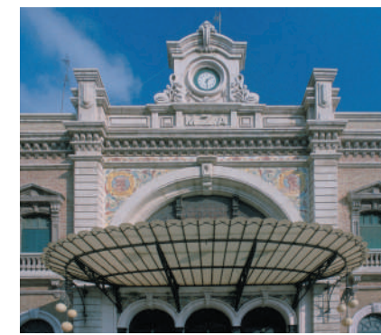
^ Railway Station