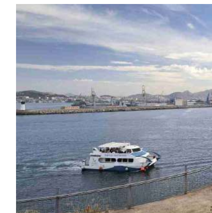
^ Tourist Boat