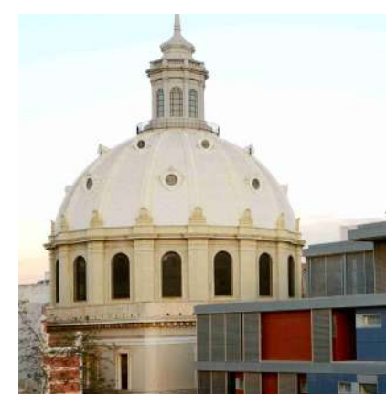
^ Caridad Basilic