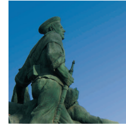
Monument to the Heroes of Santiago de Cuba and Cavite