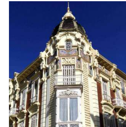
^ Aguirre House. MURAM