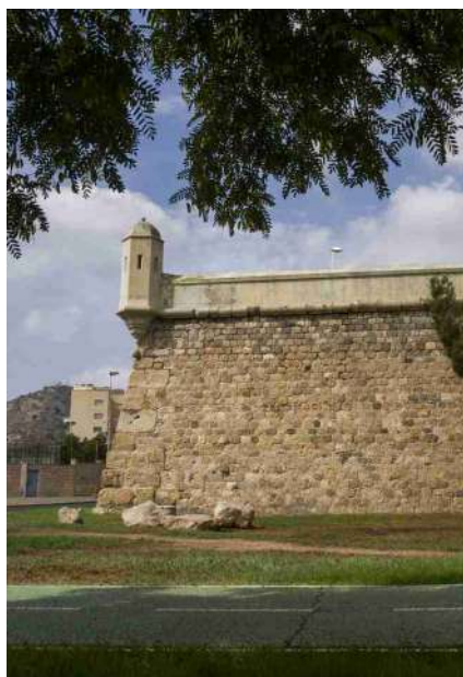
^ Carlos III Rampart