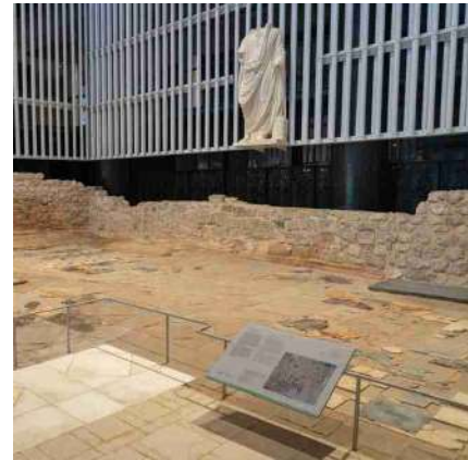
^ Roman Forum Museum

The visit of the museum concludes with a tour of important remains of the Roman period such as the Curia, the Forum, the Sanctuary of Isis, the old roman roads, the pod's thermal baths and its entrance portico and to finish the Atrium Building. 6 Roman remains It corresponds to the major road axes of the roman period.