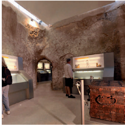
^ Centre for the Interpretation of the History of Cartagena